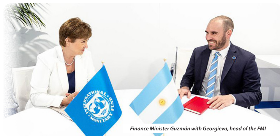
Finance Minister Guzmán with Georgieva, head of the FMI

Everyone defends the capitalists’ profits and the looting of the IMF and Wall Street!