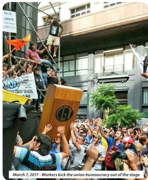
March 7, 2017 - Workers kick the union bureaucracy out of the stage

The same FIT-U, with its policy of pressure on the Peronist government, ended up closing the way for itself to be the "third force". More and more the union bureaucracies subjected the la-