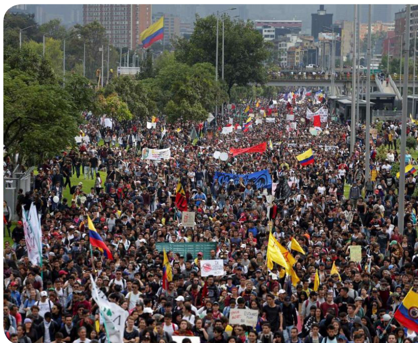
2021 Colombia protests

How can it be possible to defeat the Gringo blockade in Cuba together with Castroism, if this party of the new “red businessmen” is in the boards of oil companies such as Total, the Meliá hotel group, the Canadian nickel transnationals, when all these are listed not only in the European stock markets, but also in New York and distribute dividends from the exploitation of the Cuban masses on Wall Street? How to combat the US blockade on Cuba by begging Biden