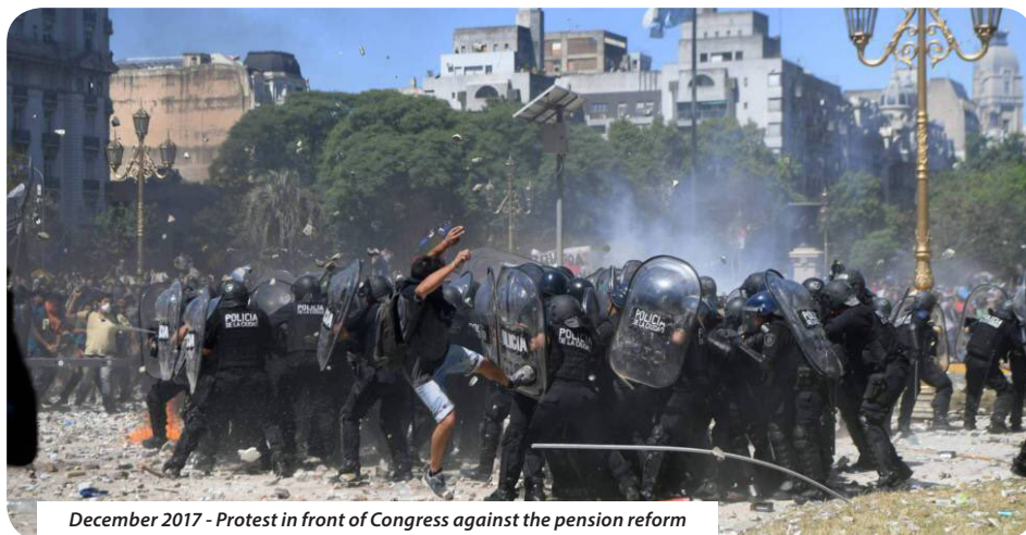
December 2017 - Protest in front of Congress against the pension reform

The surrender of the collective bargaining and salary and millions of jobs, have placed the bureaucracy as direct agents and have been integrated by the ruling elite as a true internal police that executes the plans of the capitalists, as human resources managers within the labor movement. And just like in the ‘90s, they have