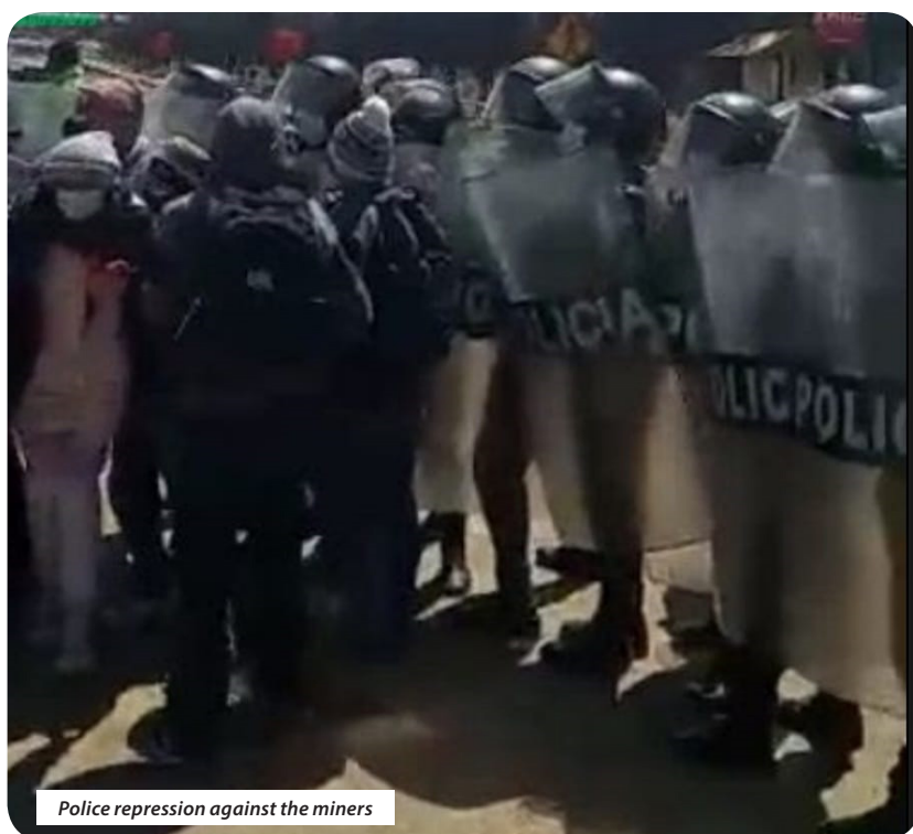
Police repression against the miners

(Liga Socialista de los Trabajadores Internacionalistas de Perú)