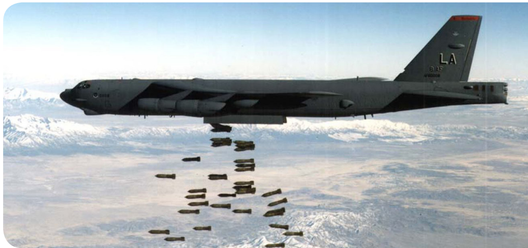
US bombardment over Afghanistan, 2001

Millions of miners, oil workers, agricultural workers and poor peasants, had