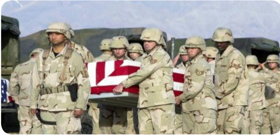
Losses of the US marines at the hands of the Afghan masses, 2001

And 20 years passed... of torments, sacrifices and genocides for the masses of the Maghreb, the Middle East and the former Muslim Soviet republics. There is the Chechen genocide of that butcher Putin from Russia. But the masses didn't stop fighting either in the Middle East or in the United States, and imperialism clashed with them in the face of its military and looting adventures. The American working class revolted. That's the truth. That is the weakness of US imperialism, beyond the fact that reformism and the traitors of the world proletariat have subjected IS S masses to Biden, the scoundrel and pirate of Wall Street. In that force the anti-imperialist victory lies of the withdrawal of the US forces from Afghanistan today.