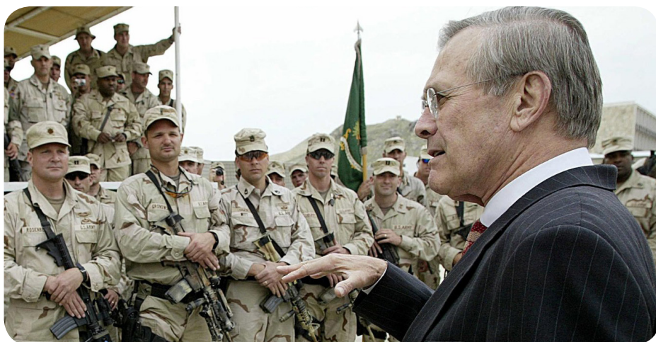
Donald Rumsfeld, Bush's Secretary of Defense, with US troops in Kabul, 2003

There is no solution for the invaded looted tormented Afghanistan without conquering a workers and peasants Afghanistan, based on the shorahs and the workers and people's militia, in a Federation of Soviet Socialist Republics of Central Asia, together with its siblings, the working class and the exploited masses of the entire Middle East today in their uprising.