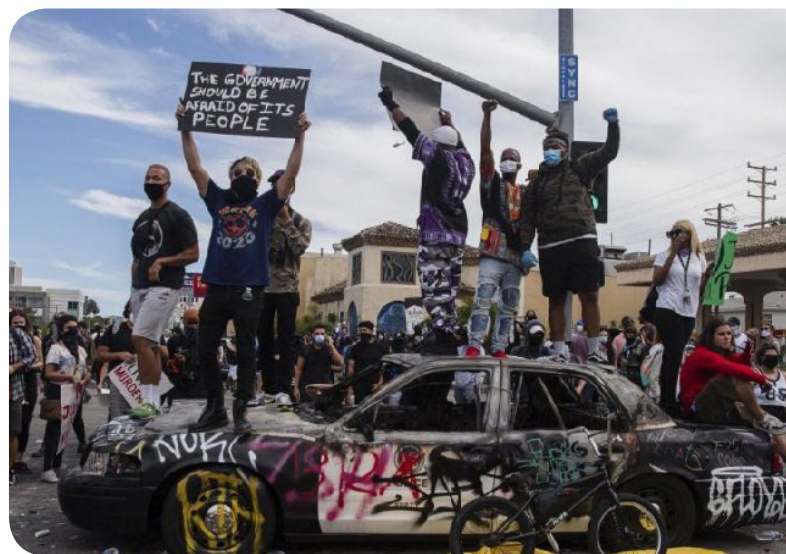
Protests in EEUU - 2020

We stand alongside the huge general strike of millions of Iranian workers who show that only the working class will be able to liberate that nation from imperialism, seizing power and defeating the infamous counterrevolutionary regime of the Ayatollahs, as part of one and the same revolution throughout the Maghreb and the Middle East. This is the only way to defeat Zionism, which occupies the Palestinian nation, and imperialism that plunders all the wealth of that region. We fight alongside the masses of Hong Kong and Myanmar. Together, we raise the cry of freedom and the right to self-determination of the Uyghur people in China, as part of the struggle of the proletariat of that country to end the counterrevolutionary regime of the "red businessmen" of the Communist Party. In the victory of these revolutionary battles today