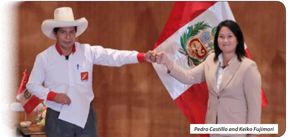
Pedro Castillo and Keiko Fujimori

Weeks earlier, the Peruvian “right” and the pseudo-leftists (Caviar left) were engulfed in a visceral debate when Prime Minister Bellido presented his ministers, since of the 18, 10 were questioned for having complaints that they support Shining Path and its political arm Movadef (Movement for Amnesty and Fundamental Rights). As can be seen all this week, the streets of Lima were filled with demonstrations from one bourgeois side and the other, managing to congest the main avenues of the city, the “right” of the bourgeoisie demanding the departure of the 10 ministers and the Caviar Left (the left of the bourgeoisie) defending them by mentioning that they are supposed “representatives of the people.” When in fact both have an agreement to keep Peru under the tutelage of the U.S. and their military bases, respecting and defending the private property of businessmen and transnational companies, repressing the miners and their families who defend their jobs.