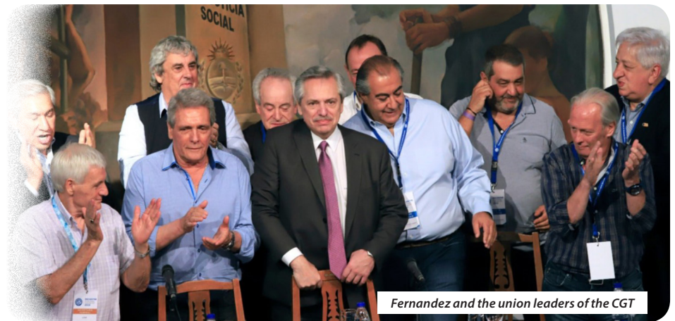
Fernandez and the union leaders of the CGT

Defeating the union bureaucracy is the way to untie the hands of the working class to put a foot on the capitalists' chest and reopen the way