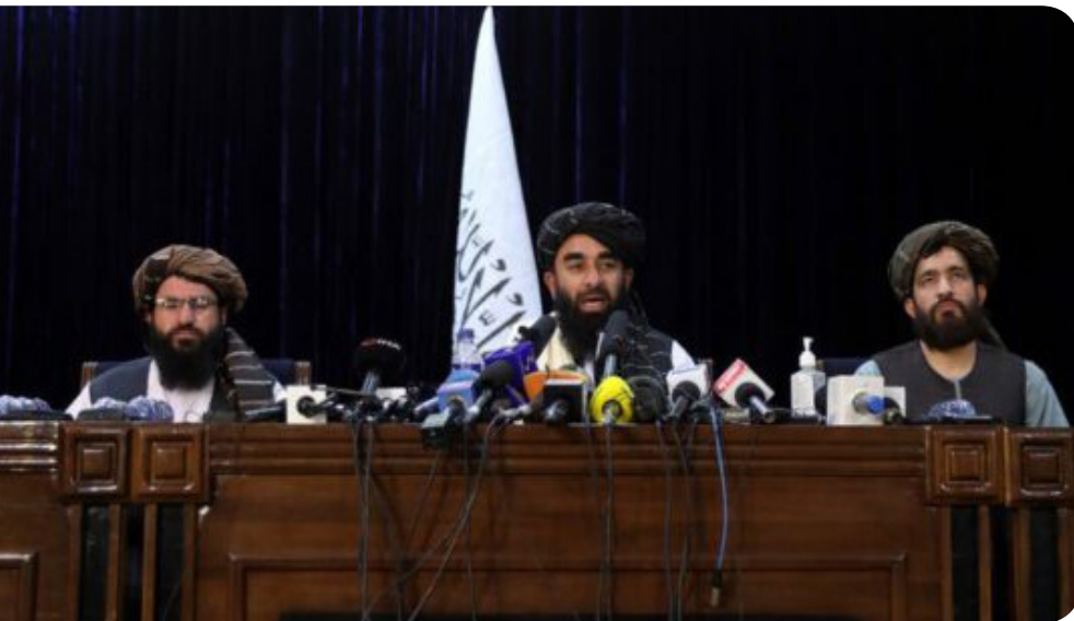
Taliban press conference in Kabul

to be the biggest terrorists in the planet and the carriers of the cruellest barbarism to the peoples they subjugate. They are called by the bourgeoisie, their spokesmen and the reformist left as “civilization” while the masses, the subjugated people that are defending from the looting of the oppressors are called “barbaric peoples” as it was said in Caesar’s Rome. Here, imperialism is barbarism and the antiimperialist struggle of the masses is the only way forward for civilization , that is to say, the victory of the revolution.