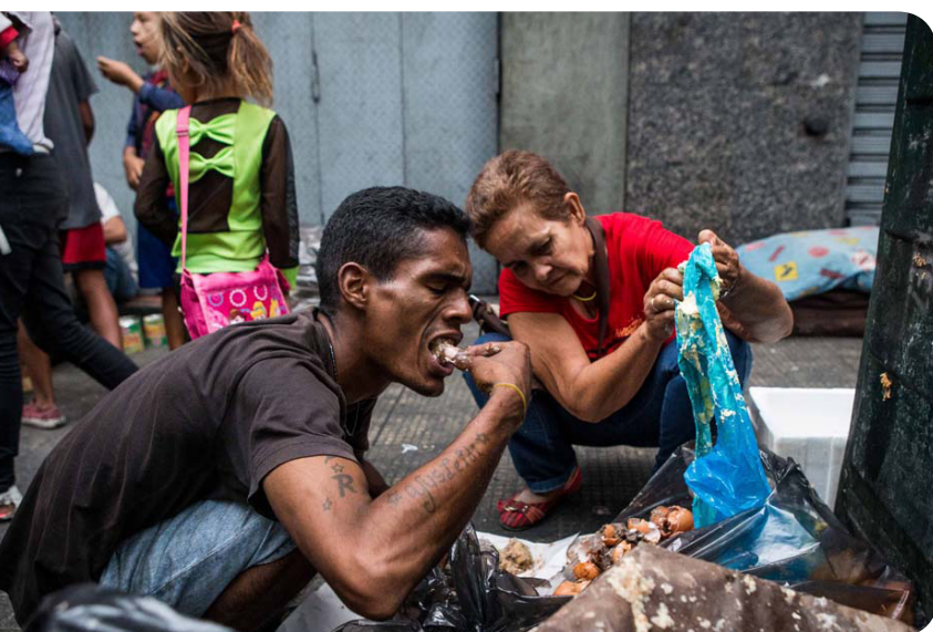
The exploited in Venezuela eating from the garbage

Days ago, when it was the stock market crisis, all these companies, both state owned and private ones, were immediately withdrawn by the Chinese government from Wall Street Stock Exchange. This was because the “red entrepreneurs” in Peking were in panic that the price of these companies could be devalued and so the US imperialist pirates would buy most of their shares at a very low price. The reason is that imperialism is not only attacking China politically, but also financially. America first... Off the shores of China, the US imperialists show their gunboats, in an aggressive and offensive policy, sustained even from its military base installed in Japan. While China develops an arsenal and a defensive military force on its borders, it is the United States that travels with its military fleets and bases throughout the Pacific. Today, to get out of the current catastrophe, imperialism prepares new wars and economic and military blows to control China. The economic and political battle for China gets deeper under Biden’s command, as guns and gunships are deployed over the Pacific.