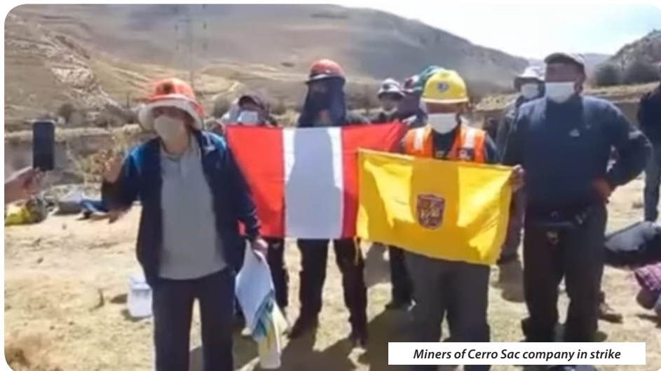
Miners of Cerro Sac company in strike

Now we see the professor as the representative of the bourgeoisie who, as soon as he assumed the presidency, unmasked himself as the defender of the business of the rich, since his hand did not tremble to brutally repress, with his police, the miners and their families in the Pasco hill who are desperately defending their jobs, and after resisting this attack, these miners and their families undertook a “march of sacrifice” and have been fighting in the streets of Lima for three days now until they are reinstated in their jobs.