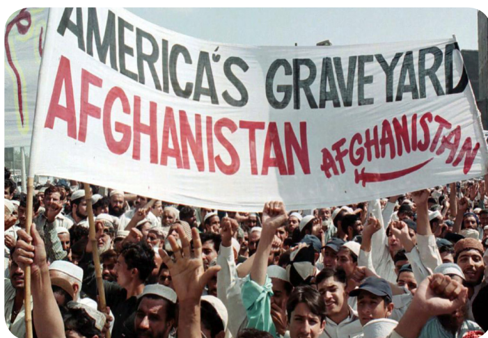
Marches in Pakistan against the US 2001

This was agreed at the Doha summit among the US, the Taliban and the official government of Kabul and its puppet army. They claimed that it had almost 300,000 men. The US gave it 89,000 million dollars a year. "It was an expensive court for Caesar in his occupation of the barbarian peoples." "Surprisingly," this army disbanded within 24 hours. Actually, a voracious bourgeoisie of the finances and the commissions on the transit of merchandise through Kabul, with its generals, did not have more than 20,000 soldiers under arms. The rest were nothing more than lists of soldiers and officers on paper. And those generals collected the bulk of those millionaire payrolls sharing them with the American generals. This is "the leg that failed", and ultimately it exposed what is really happening: the US must withdraw from Afghanistan because it can no longer fight directly the