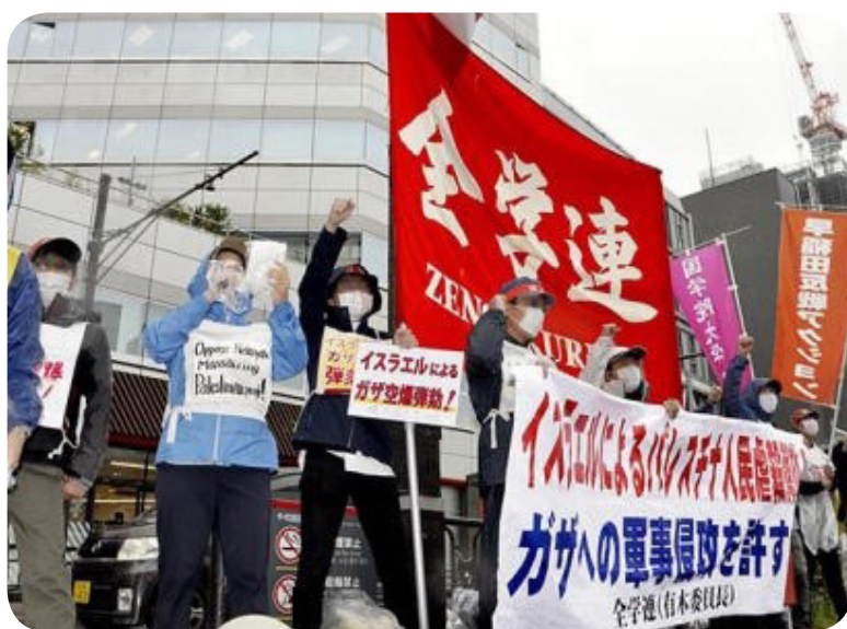
Zengakuren youth's protest at the Zonist Embassy in Tokyo, supporting the Palestine masses (May 19th, 2021)

Let us continue fighting together against imperialism, the bourgeoisie and the enemies of the world proletariat! For the working class and the oppressed peoples of the world to live, imperialism must die!