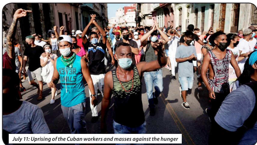
July 11: Uprising of the Cuban workers and masses against the hunger

We will fight together with the masses of Colombia, with the workers who rose up in Cuba against the hunger they suffer from the capitalist restoration imposed by Castroism, and with the indomitable American working class.