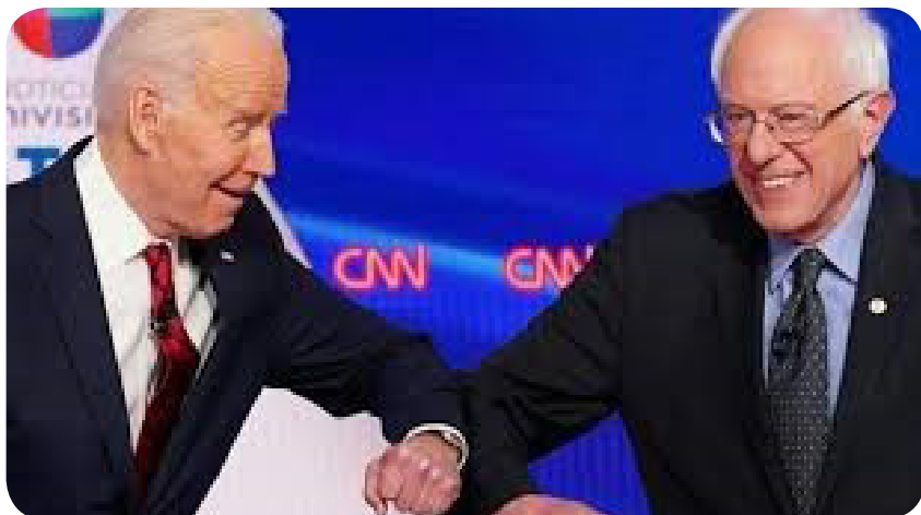
Joe Biden and Sanders

Imperialism and the bourgeoisie have taken care of giving Stalinism a survival after it handed over the former workers’ states in 1989, so that they continue to act as true internal police in the mass organizations and the unions, as well as to