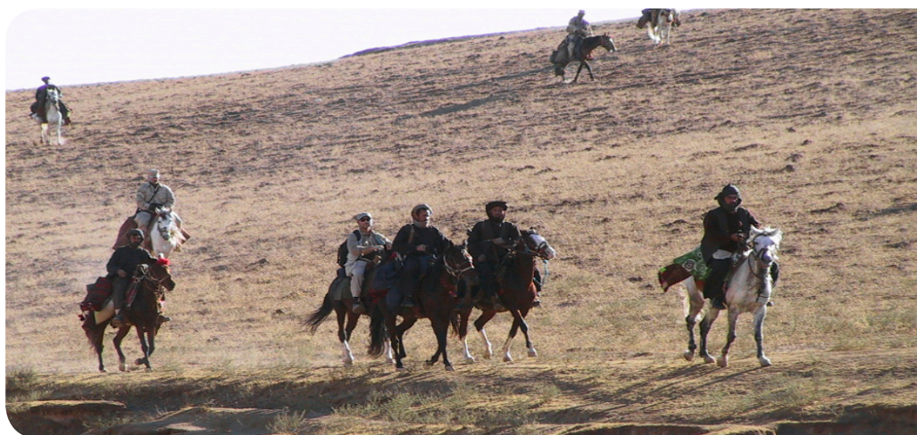
Pro-US North Alliance 2001

The Taliban? Excellent students to take care of the business of the imperialist powers and the US pirates in their withdrawal from Afghanistan. After more than 40 years along which they were supported by imperialism, with whom they later made a pact in the invasion, they have learned. Today they return to power renewed in some ways, to enter the "international community."