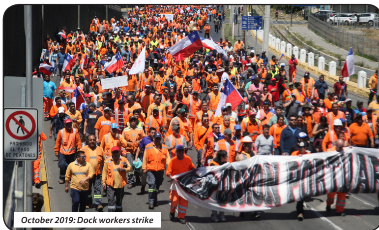
October 2019: Dock workers strike

National Congress of grassroots delegates of the workers, poor peasants, rebellious youth and all the exploited masses to resume the path of the Revolutionary General Strike