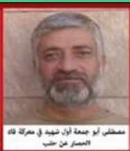
مستطاب أبو جعدة أول شهيد في معركة دارا الحصان بن حني