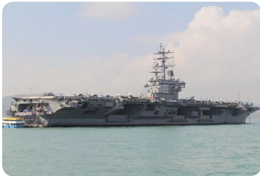
US Aircraft Carrier USS Ronald Reagan in the South Ocean of China

Reformism intends to fight fascism and bonapartist regimes by subjecting the proletariat to the fractions of the bourgeoisie that claim to be "democratic". This is a fallacy. The proletariat defends democratic freedoms with arms in hand and with the method of proletarian revolution. The fight to set up bodies of armed dual power of the masses at the beginning of any pre-revolu-